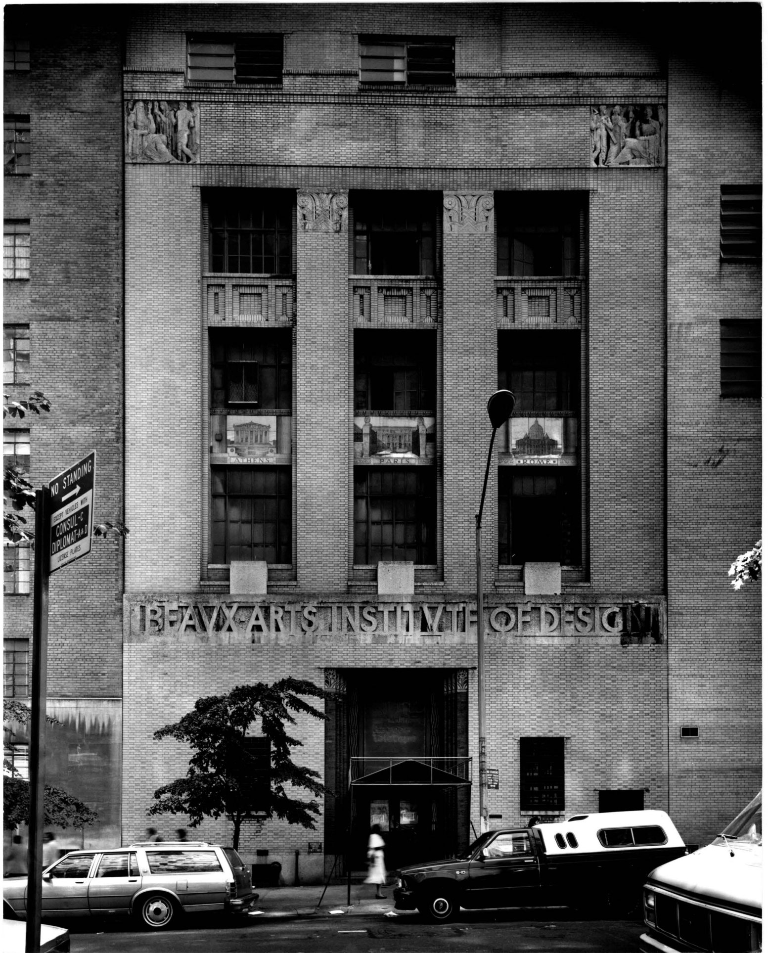
Beaux-Arts Institute of Design 304 East 44th Street