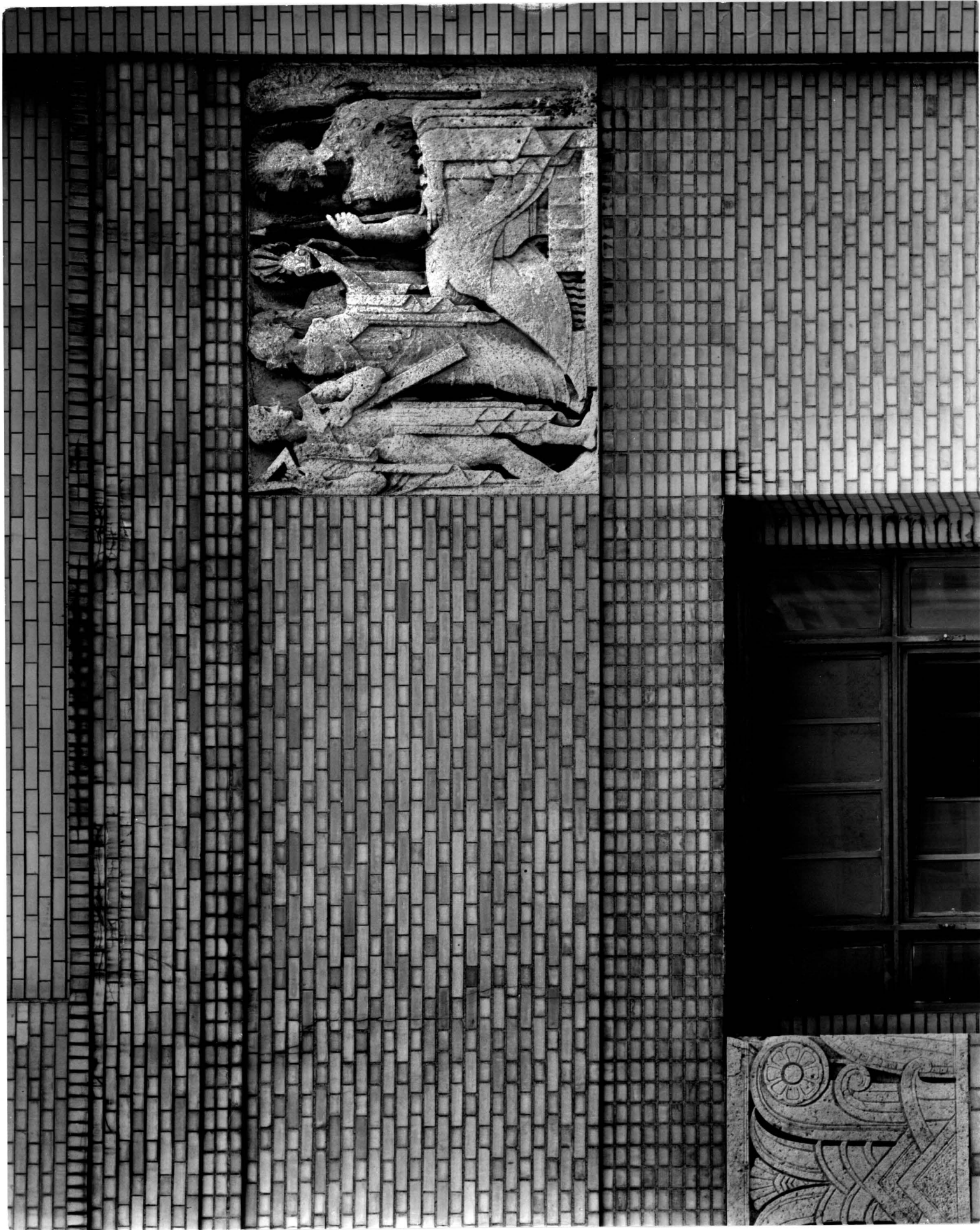
Beaux-Arts Institute of Design Detail, figural panel