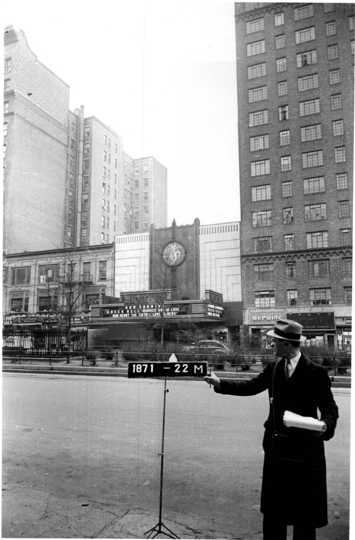
Midtown Theater (now Metro Theater) Historical Photograph 1938, view of facade