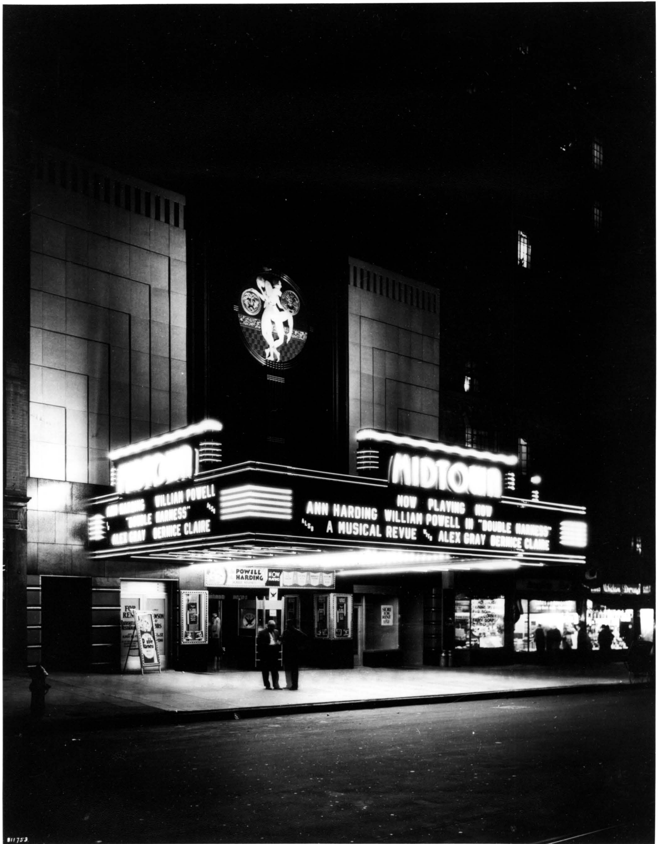
Midtown Theater (now Metro Theater), 1932-33 2624-2626 Broadway Historical Photograph 1933, View of facade