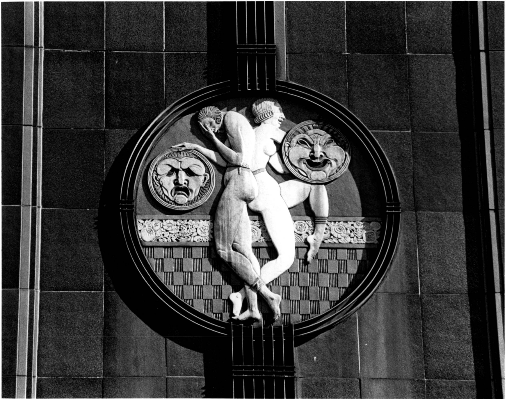
Midtown Theater (now Metro Theater) Facade Medallion