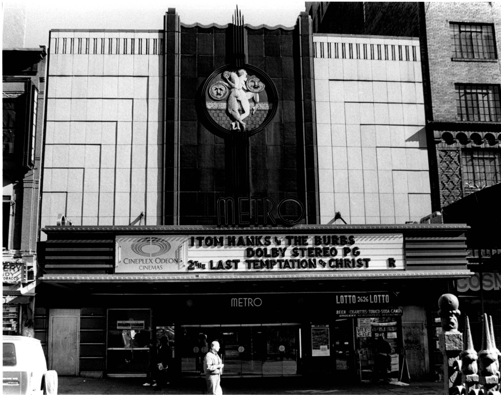
Midtown Theater (now Metro Theater) Full view of facade